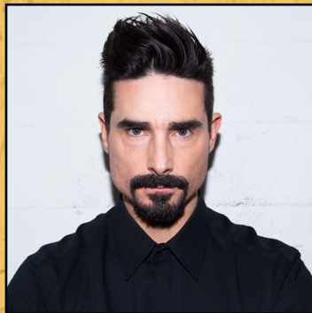
KEVIN RICHARDSON BACKSTREET BOYS