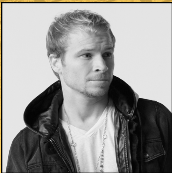
BRIAN LITRELL BACKSTREET BOYS