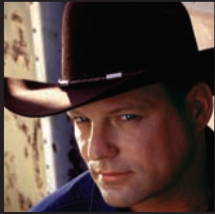
John Michael Montgomery